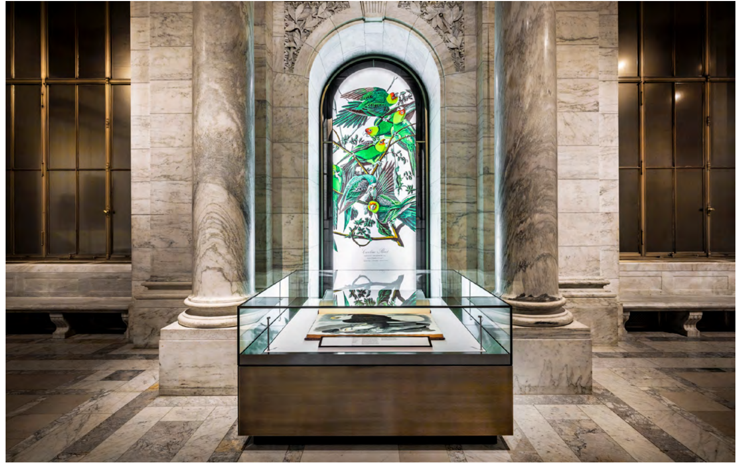
ABOVE: Specially-designed cases were needed to display items such as Audubon's large volume of Birds of America . BELOW: Elizabeth Catlett's Political Prisoner highlights the collections of the Schomburg Center for Research in Black Culture.