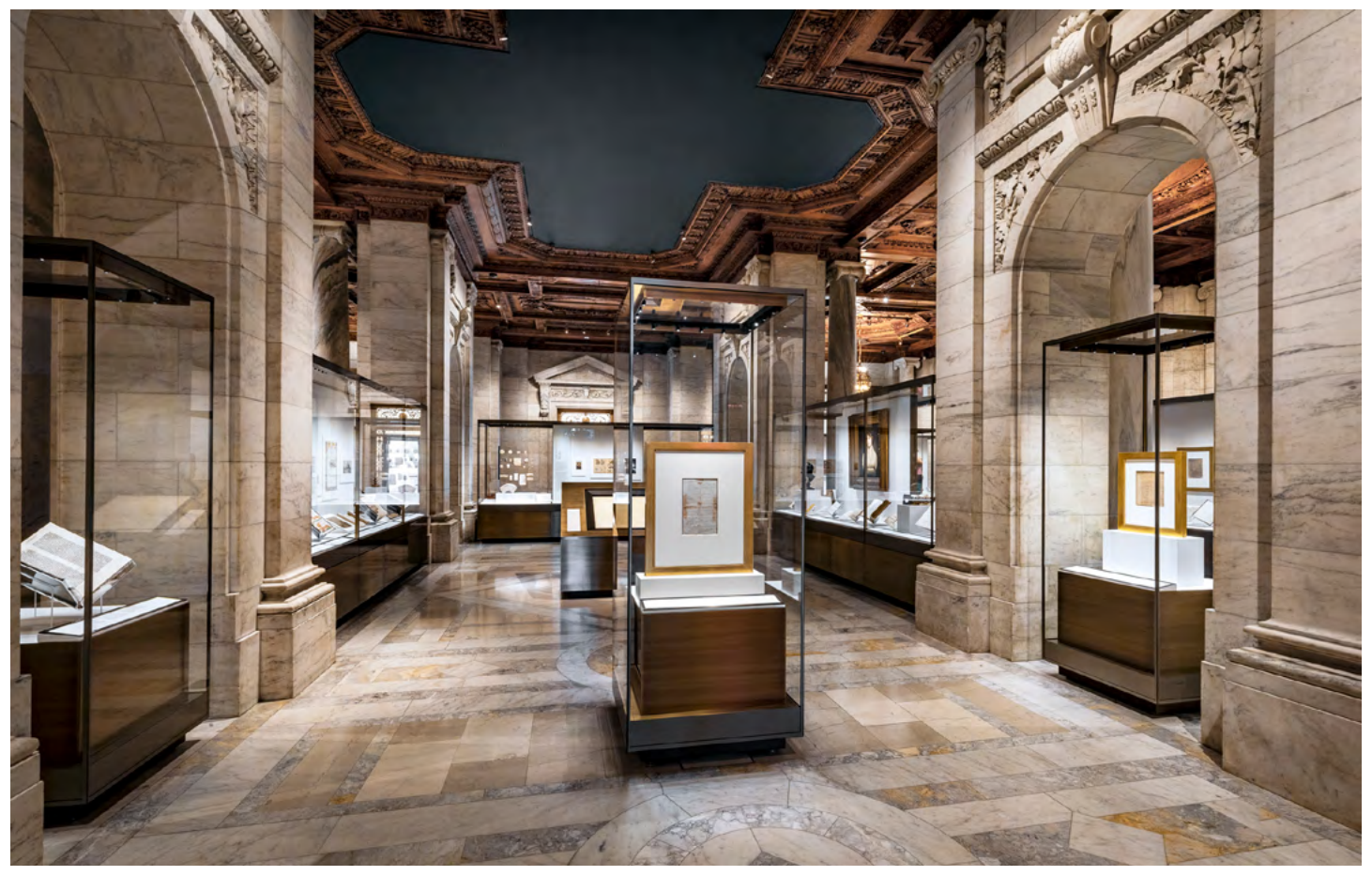
ABOVE: A case displaying Thomas Jefferson's draft of the Declaration of Independence anchors the central procession into the exhibition. BELOW: The "Beginnings" section of the exhibition highlights collection items representing knowledge and progress.