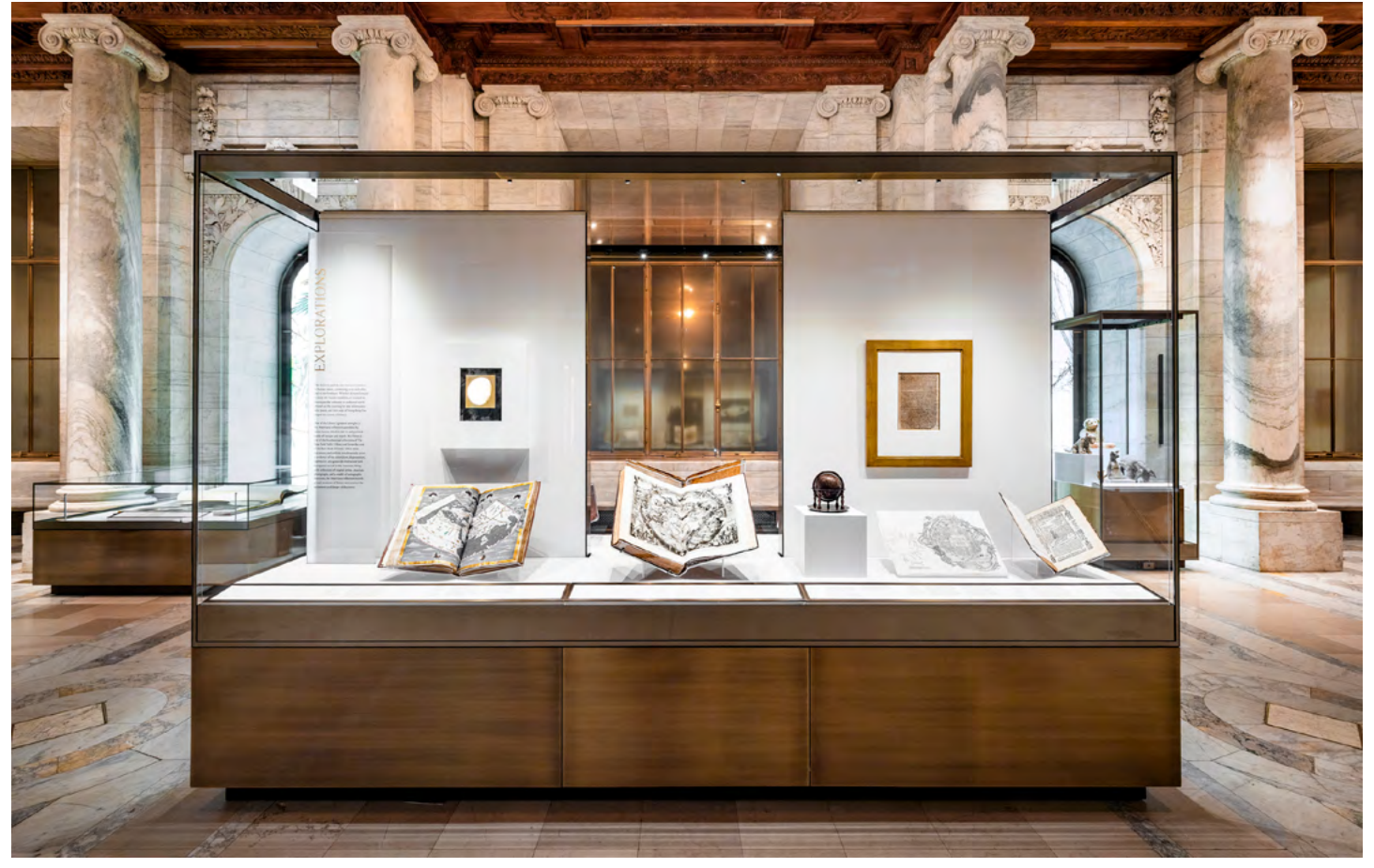
ABOVE: Low-iron, non-reflective glass used in the casework allows visitors to see the works on display as clearly as possible. BELOW: Pure+Applied worked with NYPL to conceive the best ways to display the objects given their conservation needs.