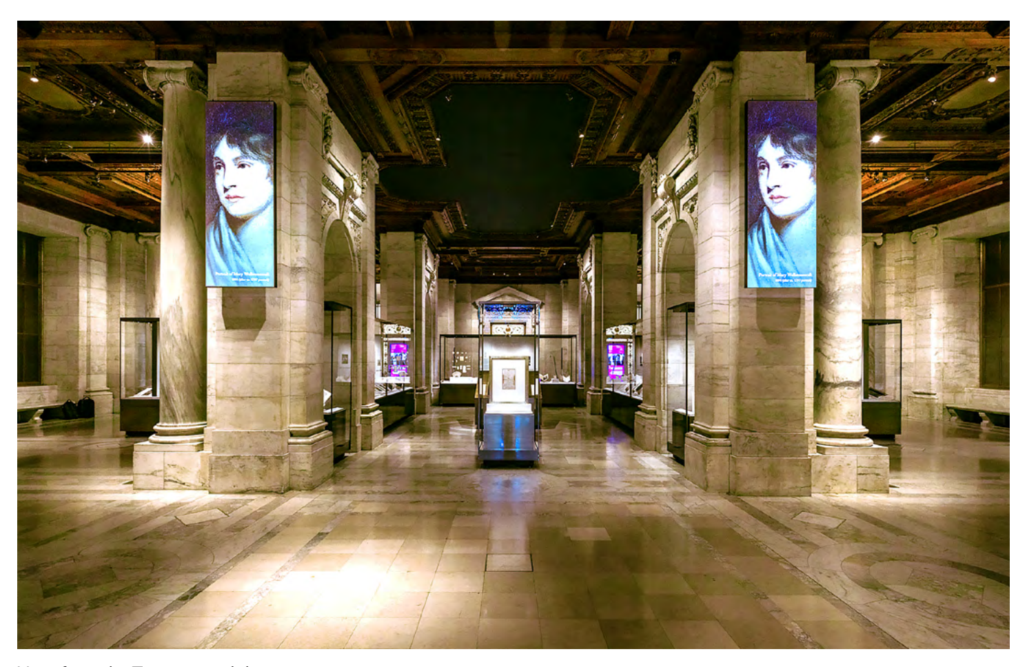
View from the Treasures exhibition entrance.

From conceptual development, to graphic identity and branding, to drawings, elevations, installation, and future planning, our studio treated every step of the design process with the care it deserved — ultimately creating an exhibition experience that will be treasured by millions.