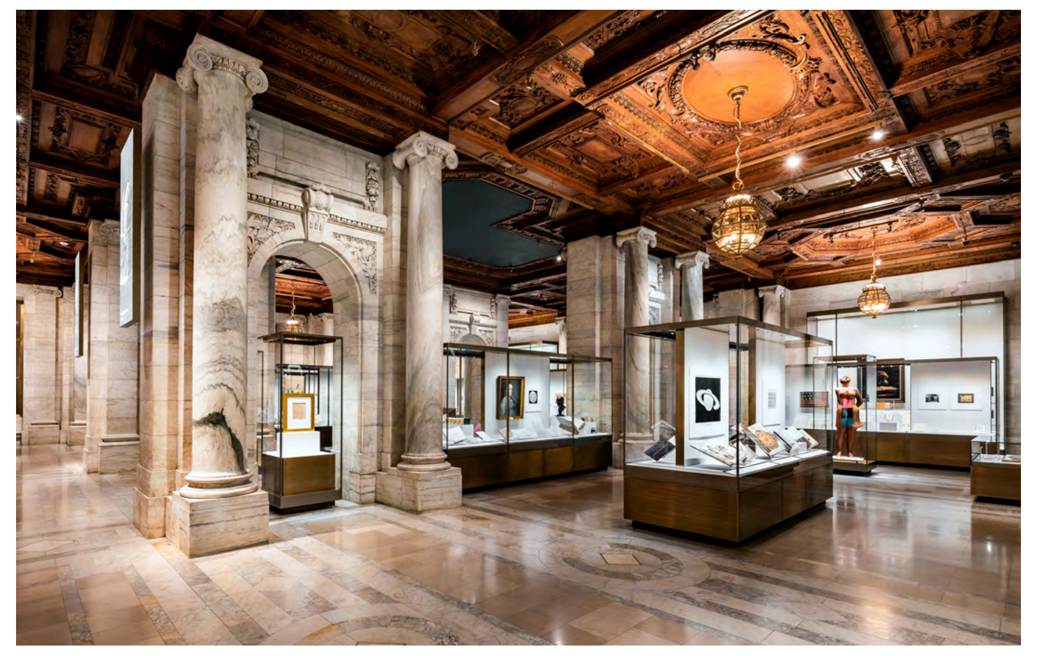
ABOVE: The casework, manufactured by Goppion, is cladded in a bronze patina to match Gottesman Hall's existing finishes. BELOW: Cut-throughs in the display walls of the case interiors allow views of other sections of the gallery.